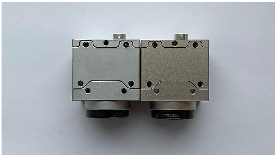
Picture 3: New carrier (left) in comparison to previous carrier (right).