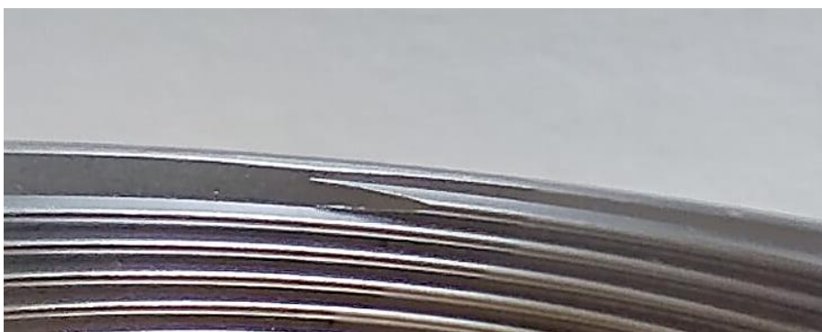
Picture 4: New ace L front carrier with a chamfer at the thread entrance.

In addition to changing the production method, the quality of the mount is improved by adding a chamfer to the thread entrance. This allows a smoother attachment of lenses to the camera mount. [Picture 4]