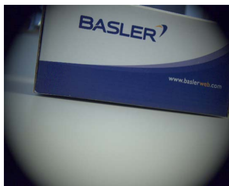
Figure 1: Vignetting Effect in an Image

Most of the lenses on the market have an optical image circle larger than 1/3", so vignetting effects shouldn't be a problem.